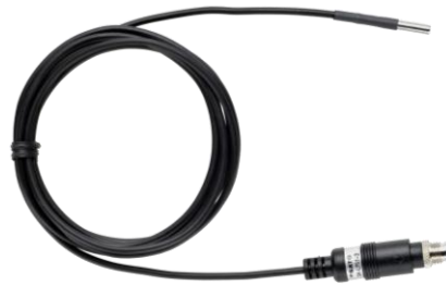
No.8810-02 Model SK-L751-2 W/-sensor-cord type