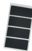
a pack of 4 pcs.

* Recommended for use in a dusty environment