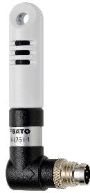
No.8810-01 Model SK-L751-1 Plug-in type