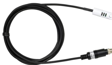
No.8880-02 Model SK-L754-2 W/-sensor-cord type